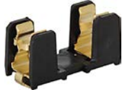
OGN-SMD for increased solder temperature with gold contacts