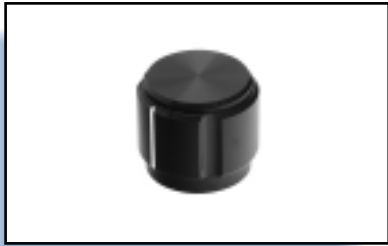
K Series - Page K4