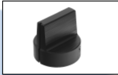
KCB Series - Page K5