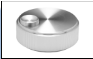
KN Series - Page K8