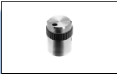
KE Series - Page K6