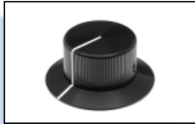
KLNS Series - Page K8