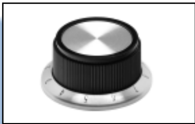
PKD Series - Page K14