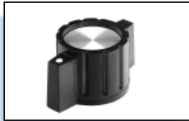
PK Series - Page K13