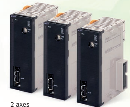
2 axes 4 axes 16 axes