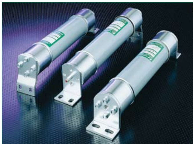
Bolt-in Mount Fuses