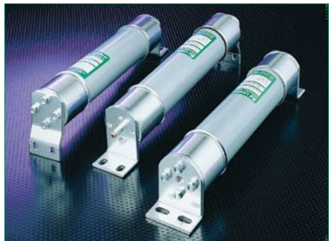
Bolt-in Mount Fuses