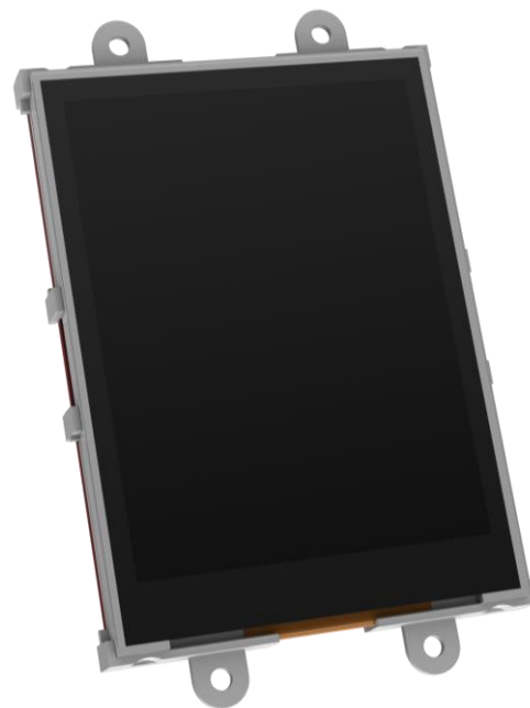
The uLCD-28-PTU Display Module