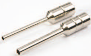
PNo 14944/SP PNo 14945/SP