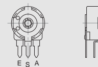
(D48, rotor shown at final position)

Power Rating: 24V / 15mA ON position resistance: ≤ 5 Ω Insulation Resistance: ≥ 30 MΩ