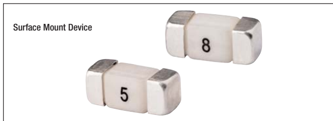
Surface Mount Device