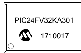
28-Lead SOIC (7.50 mm)