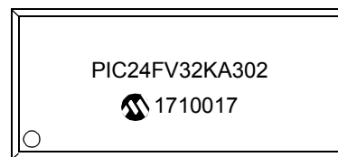
28-Lead QFN (6x6 mm)