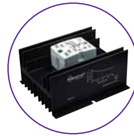
Heat Sink (SSR-HS-1) Section 3 p.20