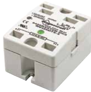
Blade Terminals DPST-NO