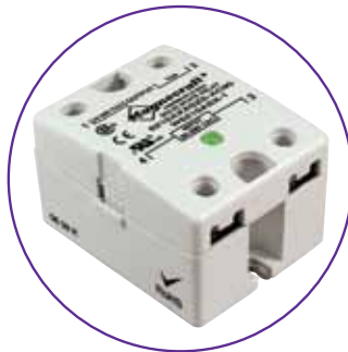
Screw Terminals SPST-NO