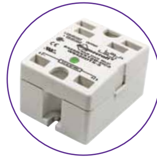
Blade Terminals DPST-NO

*Finger-safe safety cover is available for products up to 40 Amps.