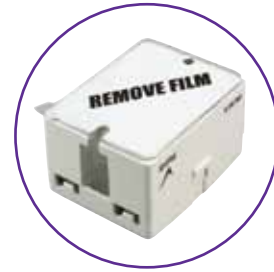
Optional Thermal Pad (SSR-TP-1) Section 3 p.21

We at Magnecraft strive to be your one-stop-shop for all of your solid state relay needs. The new line of 6 series solid-state relays give industrial relay users an energy-efficient current switching alternative. Depending on the application, these solid-state relays offer a number of advantages over electromechanical relays, including longer life cycles, less energy consumption and reduced maintenance costs. This is why great care and attention was given when developing the next generation of "Hockey Puck" style SSRs. These new SSRs will be finger-safe, fit a pre-cut heat transfer thermal pad (sold separately) and have the ability to be mounted onto a factory tested pre-drilled and tapped heat sink (sold separately).