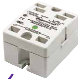
Blade Terminals DPST-NO