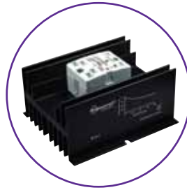
Optional Heat Sink (SSR-HS-1) Section 3 p.20