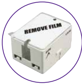
Thermal Pad (SSR-TP-1) Section 3 p.21