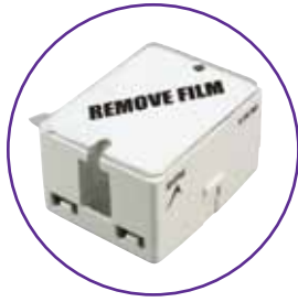
Thermal Pad (SSR-TP-1) Section 3 p.21