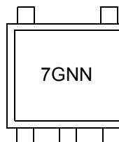
5-Lead Chip Scale