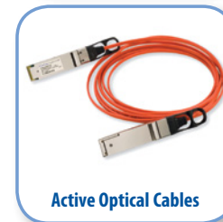
Active Optical Cables