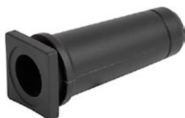
Strain_Reliefs KT14 PVC Strain Relief for rewireable connectors