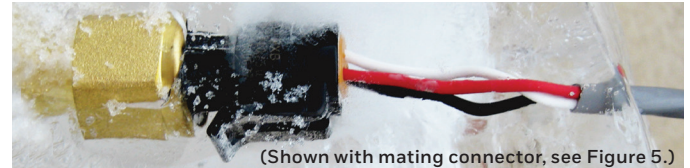
Figure 2. PX3 Series External Freeze/Thaw Resistance