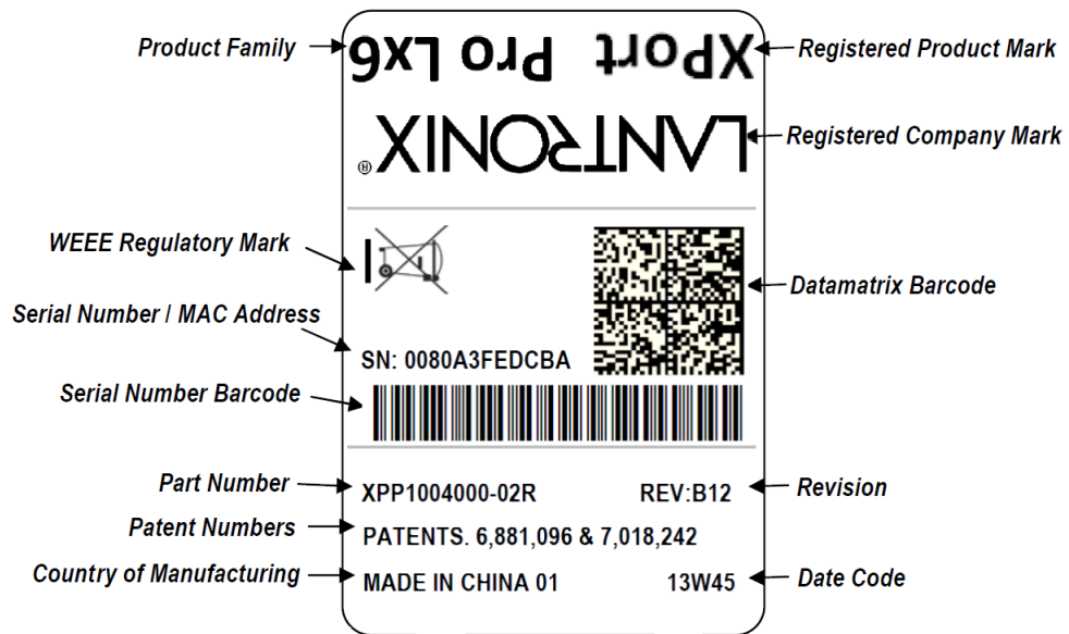
Figure 2-1 XPort Pro Lx6 Product Label