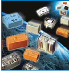
Schrack PCB Relays