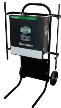
AC6000-CART-00 Two-wheeled Cart Optional for mounting ISB to allow for moving the unit while power is off