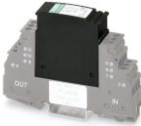
PT protective connector with protective circuit for a 2-wire floating signal circuit. HART-compatible.

Please be informed that the data shown in this PDF Document is generated from our Online Catalog. Please find the complete data in the user's documentation. Our General Terms of Use for Downloads are valid ( http://download.phoenixcontact.com )