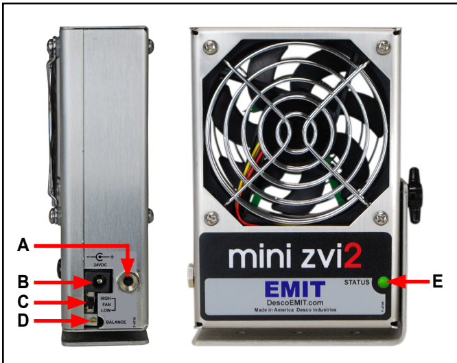
Figure 3. Mini Zero Volt Ionizer 2 features and components

A. Ground Jack: Insert the banana plug end of the included ground cord to this jack. Connect the ring terminal end of the cord to equipment ground.