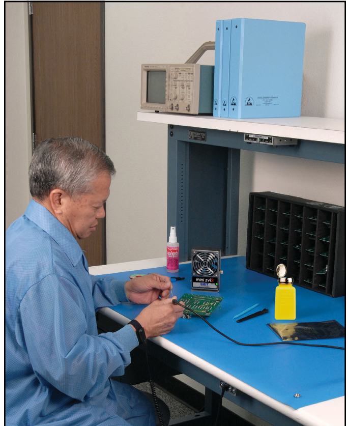
Figure 4. Using the Mini Zero Volt Ionizer 2 at a workstation.