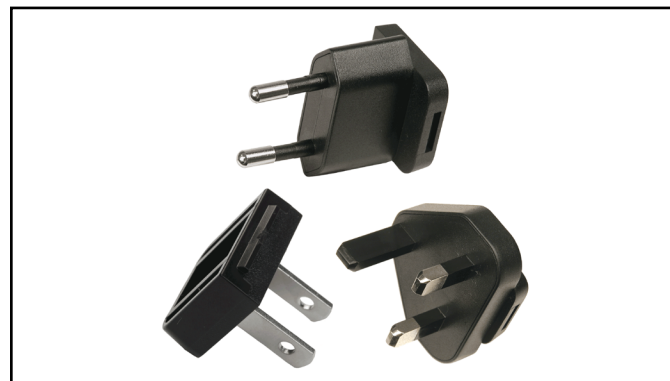
Figure 2. Interchangeable power adapter plugs included with the Mini Zero Volt Ionizer 2