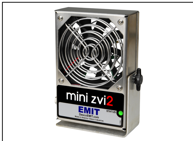
Figure 1. EMIT 50642 Mini Zero Volt Ionizer 2