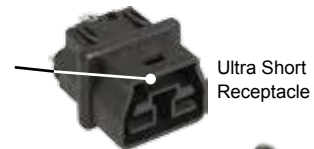
Ultra Short Receptacle