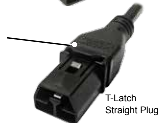
T-Latch Straight Plug