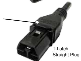
T-Latch Straight Plug