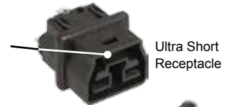
Ultra Short Receptacle