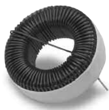
HORIZONTAL SELF LEADED MOUNT