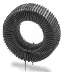
VERTICAL SELF LEADED MOUNT