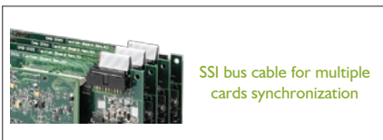
SSI bus cable for multiple cards synchronization

32-CH 16-Bit 500 kS/s Multi-Function DAQ Card with Encoder Input