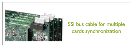
SSI bus cable for multiple cards synchronization