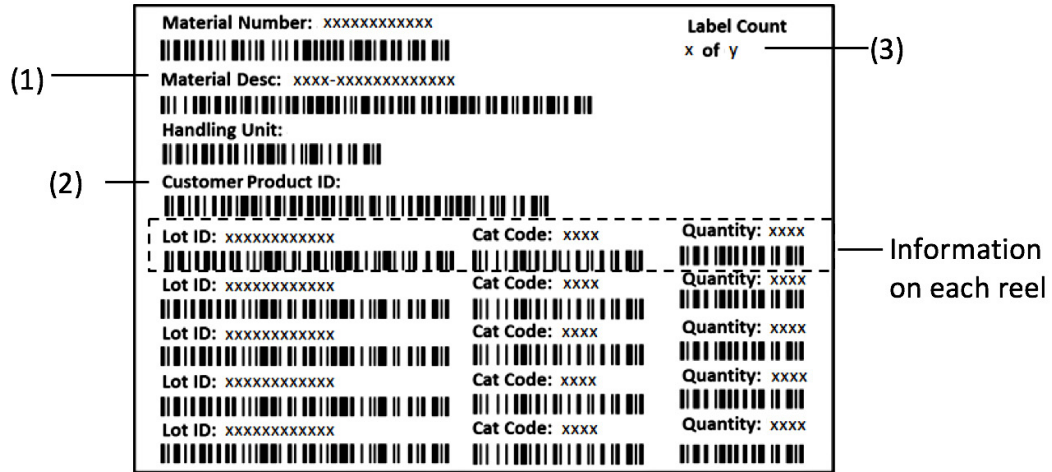
Figure 17a. Example of shipment box label format A.

Notes for Figure 16: 1. Drawings are not to scale.