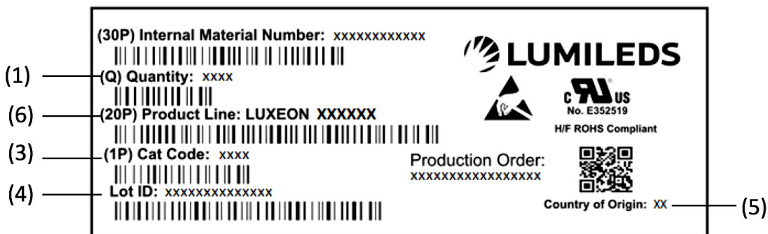
Figure 13b. Example of reel label format B.