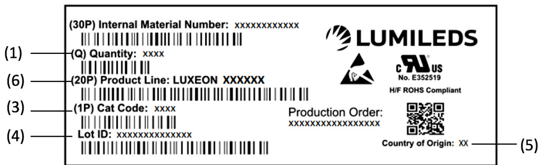
Figure 13b. Example of reel label format B.