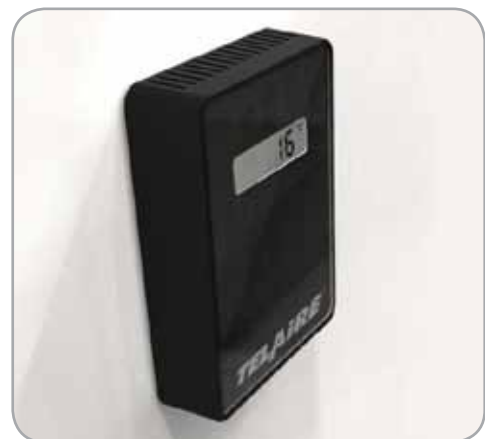
Black versions are for applications such as movie theaters