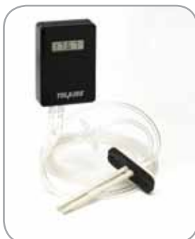
T8300-D with Pitot