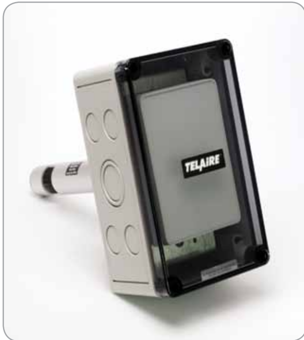
T1508 Aspiration Box for Duct Mounting

The Model 1508 is designed for in-duct sampling of CO 2 concentrations at flow rates greater than 400 fpm. Clear cover allows for observation of the sensor. They will accommodate any of the Ventostat 8100 or 8200 series, and can be used for temperature and RH when fitted. Enclosure is screwed to the duct with probe inserted into air stream. Air sampling probe is 1-inch (25.4mm) diameter and 8-inch (203.2mm) long. Enclosure (ABS plastic) has knockouts for conduit connection. Note: Wiring penetrations must be sealed prior to use. CO 2 sensor not included.