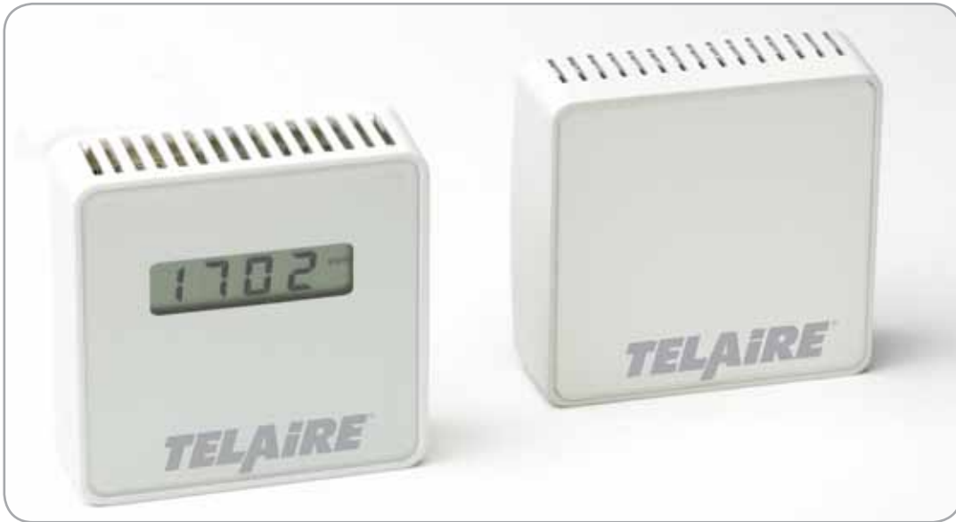
Dimensions: 81.4 mm x 86.4 mm

Smaller enclosure versions are available for regional preferences.