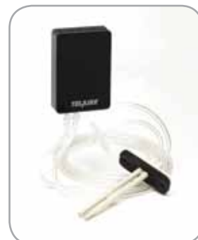
T8300 with Pitot