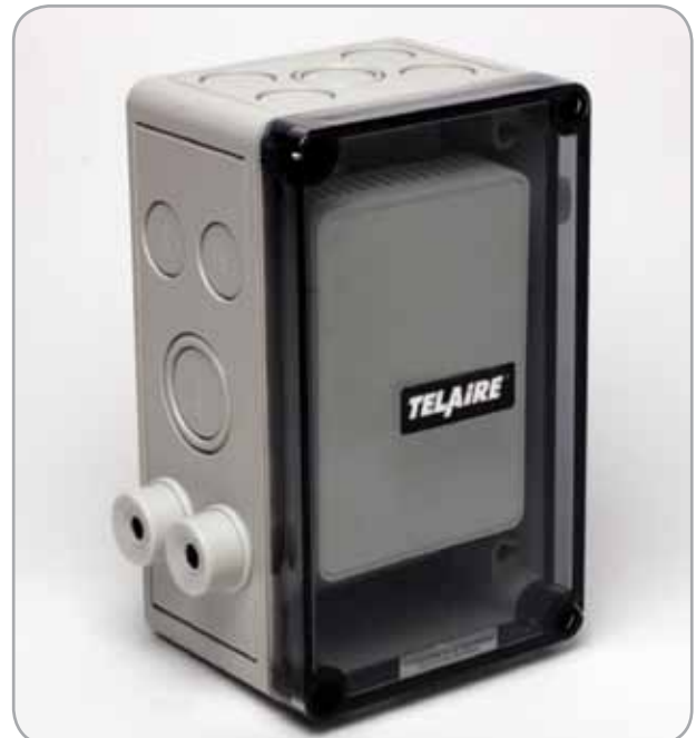
T1505 Splash Resistant Enclosure and T1552 Outside Air Enclosure

The Model 1552 is a rugged weatherproof enclosure (ABS plastic), designed to allow the 8000 series sensor to operate in an outdoor environment and/or where ambient temperatures are below freezing. The 1552 is ideal for monitoring outside air or CO 2 as a surrogate for combustion fumes in parking garages, tunnels and loading docks. This enclosure features a temperature control circuit and internal heaters to maintain the sensor within its normal operating temperature range, even if temperatures outside the enclosure are as low as -20°F (-29°C). Four diffusion ports allow for entry of CO 2 . Response time of the sensor is slowed to approximately 30 minutes to measure a 90% step change in concentrations. Enclosure is designed to screw directly to a wall. CO 2 sensor not included. Power consumption is 24V, 1.5 Amp (max), and includes the Ventostat 8000 series.