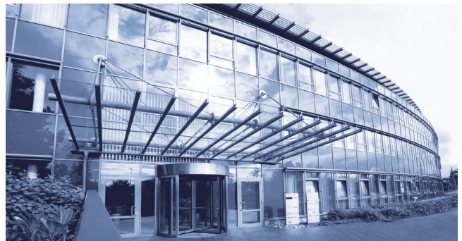
Basler AG Germany, Headquarters

Basler has three decades of experience in computer vision. The company is home to approximately 600 employees, at its headquarters in Ahrensburg, Germany, and at its subsidiaries and sales offices in Europe, Asia, and North America.