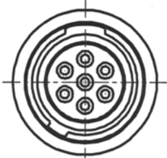
FRONT FACE VIEW SCE 7 WAY