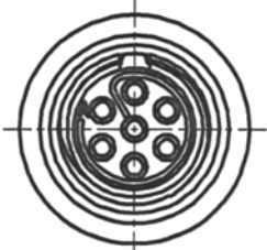
REAR FACE VIEW SCE 7 WAY