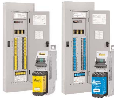
CCPB 1-, 2- & 3-Pole disconnects for the Quik-Spec™ Coordination Panelboard. Data Sheet 1160