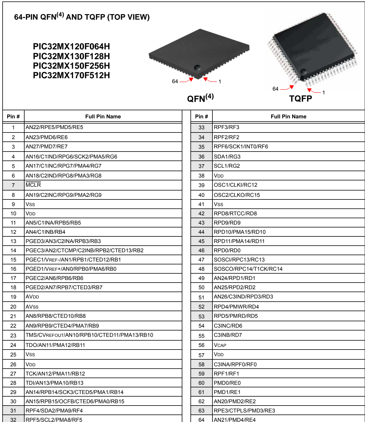
TABLE 2: PIN NAMES FOR 64-PIN GENERAL PURPOSE DEVICES