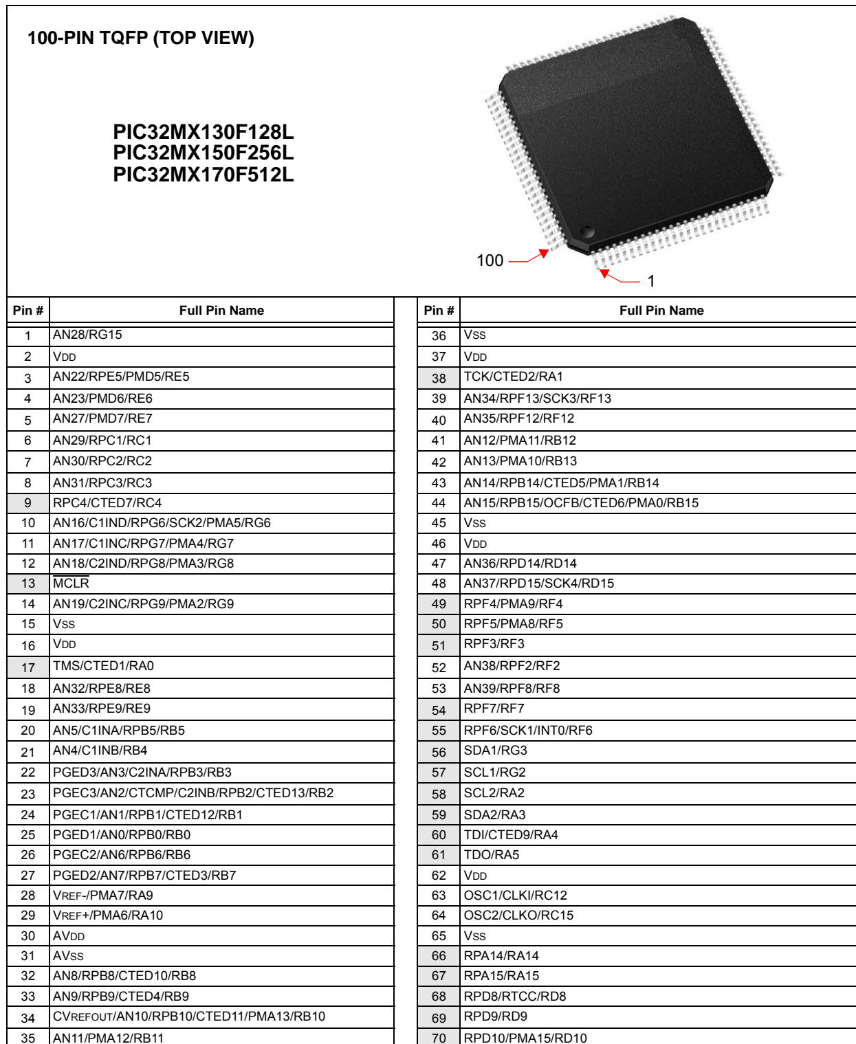
TABLE 4: PIN NAMES FOR 100-PIN GENERAL PURPOSE DEVICES