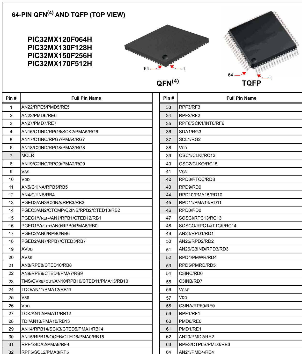
TABLE 2: PIN NAMES FOR 64-PIN GENERAL PURPOSE DEVICES