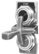
Rocker Arm Operating Lever 9001K50