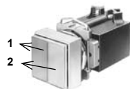
1 2 110–120 V, 50–60 Hz. Transformer