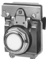
Time Delay Push Button 9001KRD