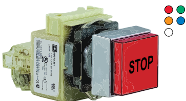
Illuminated single push button with contacts 9001KXRB1RH1 See page 70