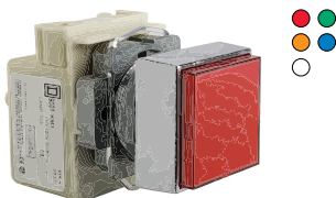
Pilot light 9001KXPA1R See page 71