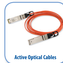
Active Optical Cables