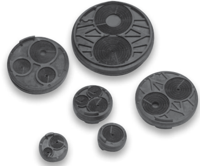
3M™ SLiC™ Rubber End Seals for the 3M™ SLiC™ Aerial Closures and Terminals