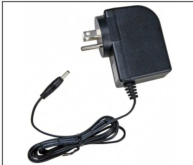
Figure 2. North American power adapter included with the 19239 and 19242 Mini Monitors