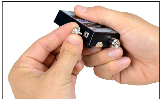
Figure 7. Changing the park snap on the 19243 Mini Monitor

The 19243 Mini Monitor includes an interchangeable 10mm park snap and 10mm banana jack adapter for operators who use wrist cords with 10mm terminations. Use the park snaps' knurled rims to unscrew the 4mm park snap from the monitor and install the 10mm park snap to the monitor. Plug the 10mm operator jack adapter into the monitor's operator jack.