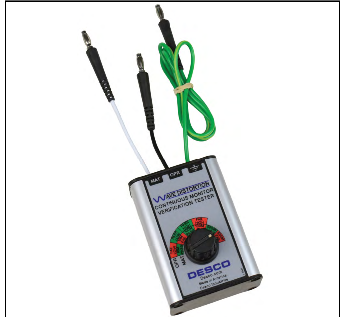
Figure 9. Desco 98221 Wave Distortion Monitor Verification Tester