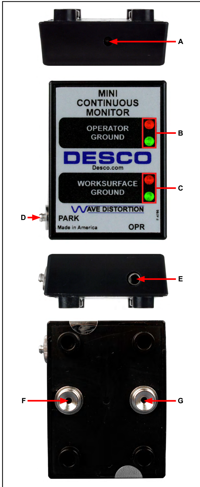
Figure 4. Mini Monitor features and components

A. Power Jack: Connect the included 24VDC power adapter here.