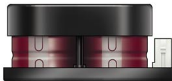
Top view, HUB