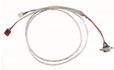
Figure 3: Communication/Power Cable (SCCPC5V)

The most common cable choice for any alphanumeric Matrix Orbital Display, the Communication/ Power Cable offers a simple connection to the unit with familiar interfaces. DB9 and floppy power headers provide all necessary input to drive your display.