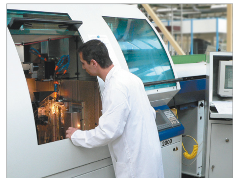
Technical information and sales contacts are available at www.radiall.com