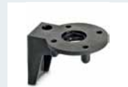
Order No. 2700143 Bracket for base mounting