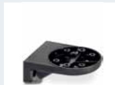
Order No. 2700149 Bracket for base mounting with hidden cable routing