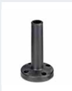
Order No. 2700156 Base with integrated tube, 110 mm long

250 mm Order No. 2700157 400 mm Order No. 2700158 1000 mm Order No. 2700154 Tube, Ø 25 mm