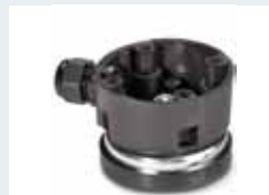
Order No. 2700155 Outlet box with magnetic base and lateral cable entry