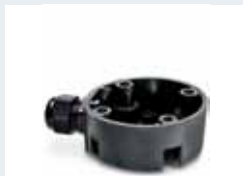
Order No. 2700153 Outlet box with lateral cable entry