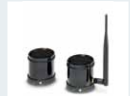
Order No. 2700683 Wireless multiplexer