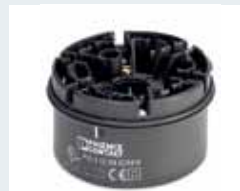
Order No. 2700093 Connection element with screw connection