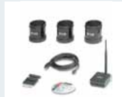
Order No. 2700679 WIN wireless system