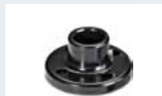
Order No. 2700164 Base for tube, Ø 25 mm, metal