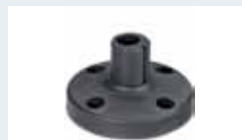
Order No. 2700163 Base for tube, Ø 25 mm, plastic