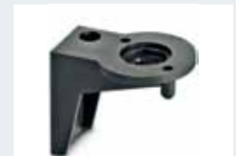
Order No. 2700144 Bracket for surface mounting