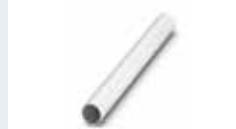
Order No. 2700152 Tube for direct mounting on the foldaway base

250 mm Order No. 2700157 400 mm Order No. 2700158 1000 mm Order No. 2700154 Tube, Ø 25 mm