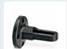
Order No. 2700161 Bracket for two-sided surface mounting