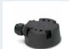
Order No. 2700153 Outlet box with lateral cable entry