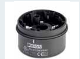
Order No. 2700091 Connection element with spring-cage connection