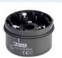
Order No. 2700092 Connection element with spring-cage connection