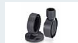
Order No. 2700151 Foldaway base, pitch 7.5°