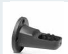
Order No. 2700160 Bracket for single-sided surface mounting