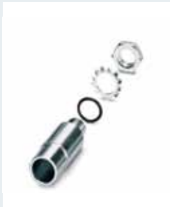
Order No. 2700150 Adapter for single-hole mounting