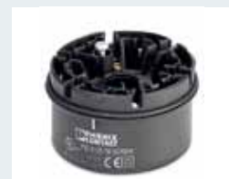
Order No. 2700095 Connection element with screw connection