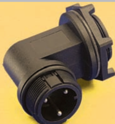
PX0803 - shown with insert