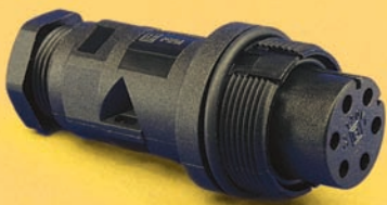
PX0801 - shown with insert