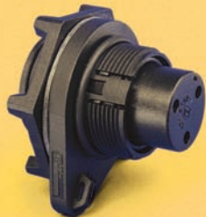
PX0802 - shown with insert