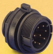
PX0805 - shown with insert