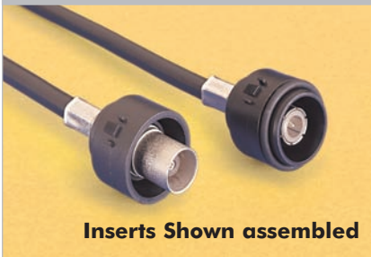
Inserts Shown assembled