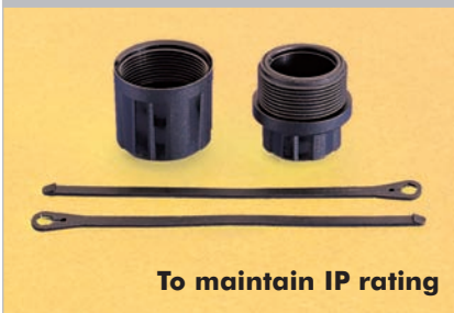
To maintain IP rating