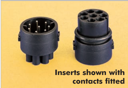
Inserts shown with contacts fitted